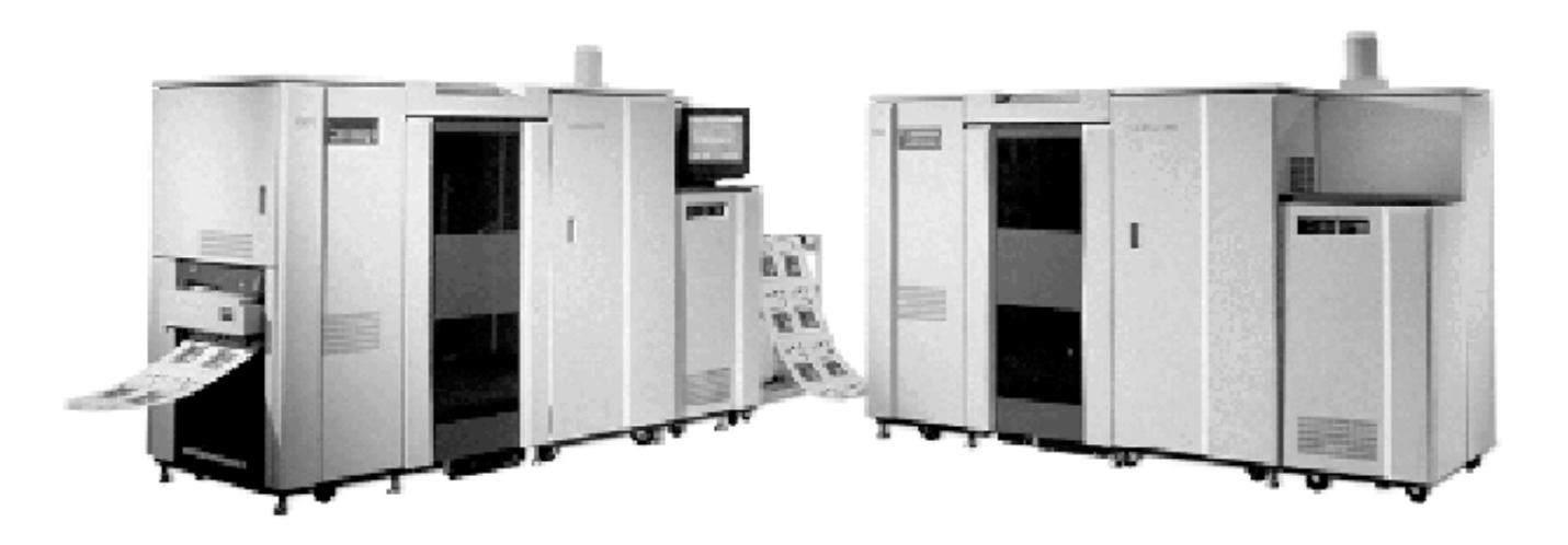
Table 134 summarizes the printer characteristics for the Infoprint 4000-IR1/IR2 and 4000-IR3/IR4 printers

Figure 35. Infoprint 4000-IR1/IR2 and 4000-IR3/IR4 Printers