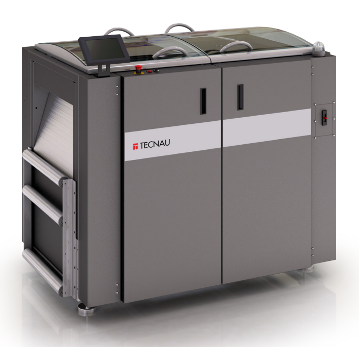
Dynamic Punching unit for 2-up production

The TC 1550 HS DP1, dynamic punching unit is the perfect solution to produce reliable documents with accurate punching patterns for easy paper handling and storage.