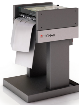
Merger TC 1105

Merge loose sheets after cutting with job separation of even and uneven number of pages.