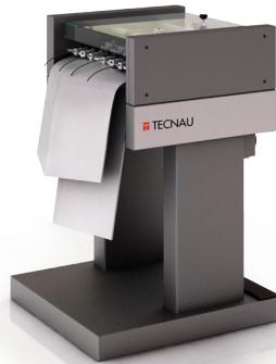
Merger TC 1105

Merge loose sheets after cutting with job separation of even and uneven number of pages.