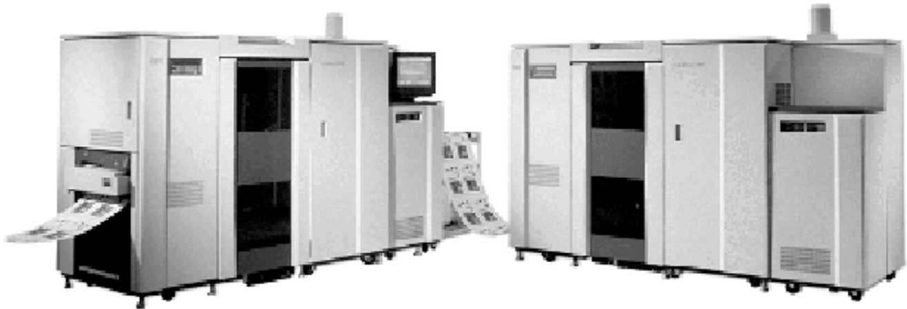
Figure 35. Infoprint 4000-IR1/IR2 and 4000-IR3/IR4 Printers

Table 134 summarizes the printer characteristics for the Infoprint 4000-IR1/IR2 and 4000-IR3/IR4 printers