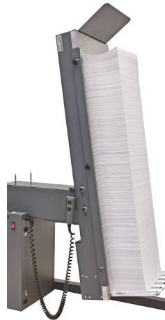
Tilt to load on StackRack.

All components use standard power, are mobile, modular, compact, and are designed to dramatically improve work-flow.